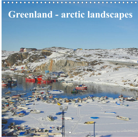
Greenland - arctic landscapes